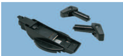
Spare Battery Slot, SBS-8000 Removable Battery Pack, RBP-8000