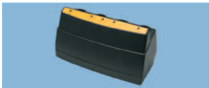
Multi Battery Charger, MC-8000