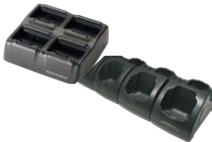
Single Cradle and Multiple Battery Charger