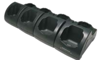
Multiple Cradle (Ethernet)